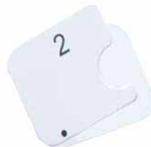
Protective Cover #GED900237