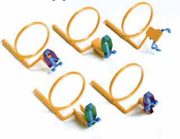
Kerr Hawe Imaging Plate Holders