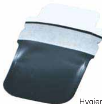
Hygiene Bag #GED900193