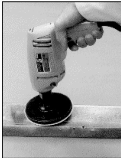
Grinding to remove permanent coatings.

Bonding the gage directly to the surface of the part, member, or structure is generally desirable. Surface coatings, including paint and metal plating, are usually detrimental to the measurement results. These coatings should be removed if possible.